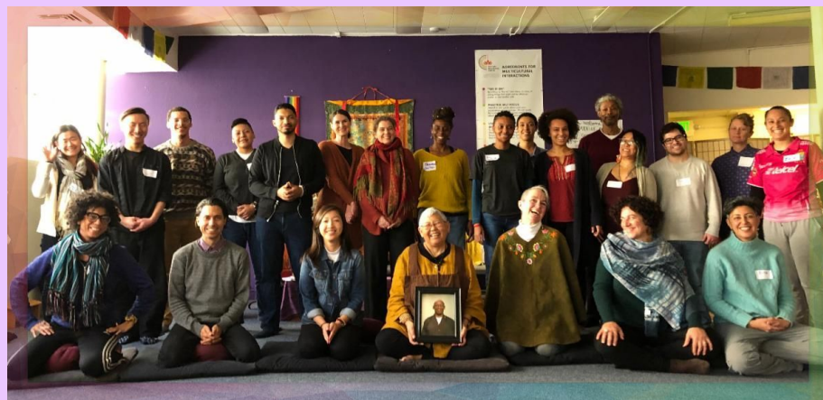
22 EBMC Sangha members receive Bodhisattva Vows and Precepts, December 2019