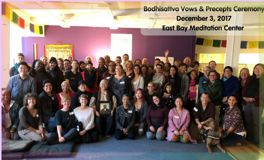
52 EBMC Sangha members receive Bodhisattva Vows and Precepts, December 2017

A total of seventy-four members of the EBMC Sangha have now received Bodhisattva Vows and Precepts, in the first ceremony offered at the Center in December 2017, and more recently in December 2019. Two members of the 2017 cohort renewed their Vows in 2019 by participating in the ceremony. Recalling the words of the great Buddhist teacher Shantideva , these Dharma practitioners have promised, "May I be a protector to those without protection" -- in fulfillment of the joyful desire to encourage and accompany all living beings on the journey of awakening.