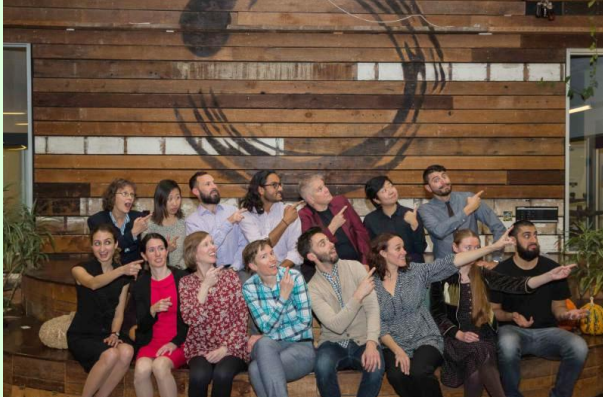
The Law Center staff, pointing in the direction of economic empowerment for ALL!

boss and none of us have a boss. We all take responsibility for the operation and programming of the organization. The attention to the present moment and mindfulness of body I have practiced in meditation gives me a chance to be a thoughtful participant in our process. Working outside of traditional hierarchies requires a commitment and patience I've learned through Buddhist practice.