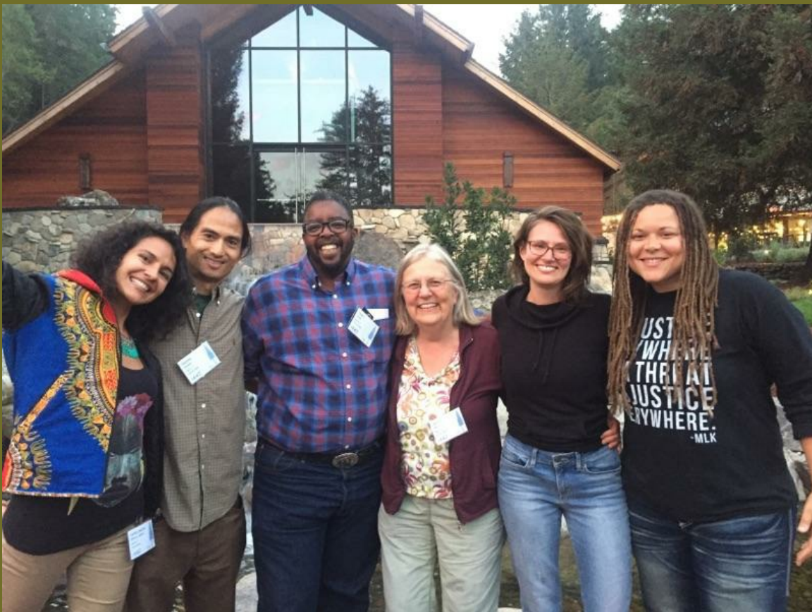
EBMC representatives at 1440's Service Week on September 8, 2017.

We'd like to thank 1440 Foundation for coordinating this event, for supporting EBMC's team in attending, and for all of the work that they do to assist so many in the process of cultivating both personal and professional toolboxes. May we find strength in each other and in the world we are currently shaping through collective reflection and transformative action.